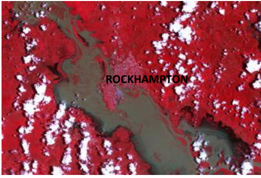
NASA IMAGE 2011 FITZROY FLOOD:-Major Fitzroy Floods:1918 (10.1m), 1954 (9.4), 1991 (9.3), 2011 (9.2m). Possible Maximum Flood (12.0m) Proposed Depot Hill Flood Levee (9.7m). Climate change prediction (10.6m) 3 Flood Study Report Fitzroy River Flood Study RRC, July 2011

What do you think about spending $39m on a 9.7m flood levee? Morning Bulletin link . RRC has climate models suggesting major floods heights will increase by 0.5 metre*. Based on previous major floods, the levee would be frequently overtopped. Hydrologists predict (Qld. Flood Inquiry) that the maximum possible extreme Fitzroy Flood could reach 12 metres . Also, how would stormwater gates work during a simultaneous heavy rain event, e.g., post-Cyclone Oswald? What are the ecological consequences of redirecting flood waters to the floodplain and wetland habitats? Contact the Mayor and MPs if you think the money could be better spent. (*add ½ metre to heights below)