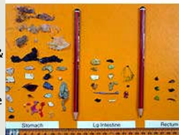
Plastic ingested by Marine Turtle